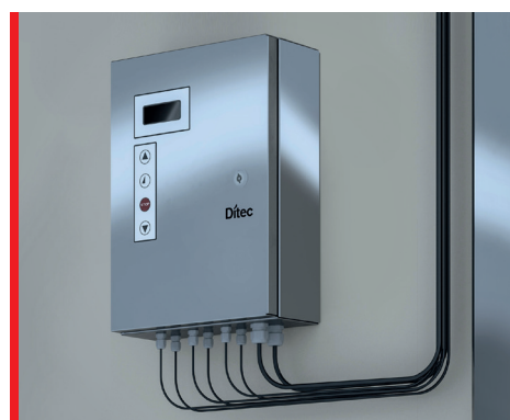
32-digit LCD display